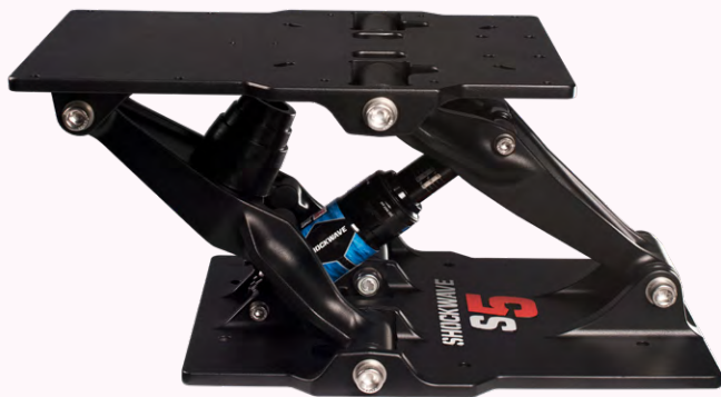
S5 SUSPENSION MODULE - BLACK SW-05026

The SHOCKWAVE S5 comes in a matte black or glossy white finish. It is easily and quickly installed in virtually any boat and can be mounted on a riser box or pedestal with minimal effort.