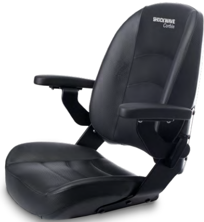
CORBIN2 SEAT BLACK SW-04920-B

Designed to pair perfectly with the SHOCKWAVE S5 , the Corbin2 is a lightweight, robust seat that comes equipped with folding armrests, a storage pocket, machined aluminum seat frames and fiberglass seat backs. These seats will outlast any marine seat on the market.