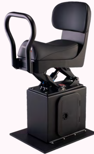
S5 JOCKEY (BOX AND HANDGRIP NOT INCLUDED) SW-S5-2400

The SHOCKWAVE S5 Jockey offers an integrated seat frame to minimize size and weight. It comes with a closed cell foam cushion, heavy-duty fabric called 'Grabber', designed for comfort and durability in extreme outdoor conditions. One of our most compact solutions.