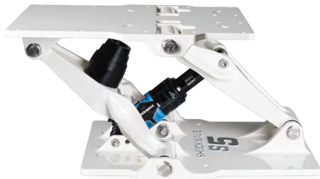
S5 SUSPENSION MODULE - WHITE SW-05026-BW