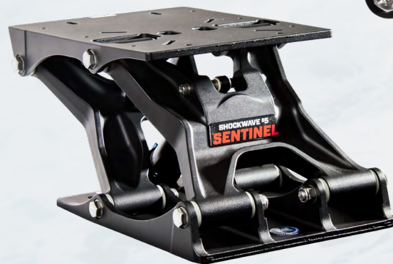
S5 SENTINEL SUSPENSION BASE - BLACK SW-07823-B

The SHOCKWAVE S5 Sentinel Suspension Base comes with a 4" travel SHOCKWAVE FOX Float H2O air-sprung shock. It is easily and quickly installed in virtually any boat and can be mounted on a riser box or a short, stocky pedestal with minimal effort. The maximum occupant weight for the S5 Sentinel Suspension Base is 250lbs [113kgs] on a vessel that sees maximum deck accelerations of 3g's. For calm waters and deck of accelerations less than 2g's, a 300lb [136kg] occupant is acceptable.