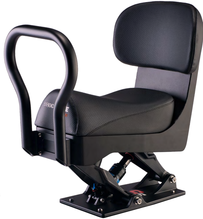
S5 JOCKEY SW-S5-2400

The SHOCKWAVE S5 Jockey Seat offers an integrated suspension and seat frame to minimize weight. The SHOCKWAVE FOX Float H2O air sprung shock features on-the-fly adjustments for firmness and rebound rate. Seats cushions made with closed cell foam and heavy-duty black fabric, well suited to commercial applications and heavy use. Designed for comfort and durability in outdoor and saltwater conditions. The S5 Jockey is one of our most compact solutions and is ideal for refits. This seat is shown with an optional front grab rail. It needs to be mounted to a riser box to provide the height needed for a comfortable ride. A riser box for this seat can be ordered from SHOCKWAVE .