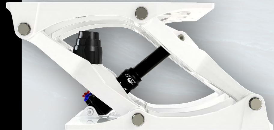
S5 SENTINEL SUSPENSION BASE - WHITE SW-07823-W