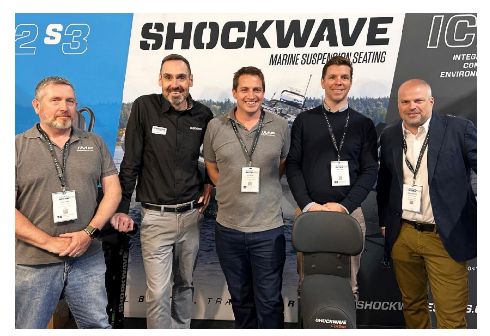
Shockwave and IMP sales team at the 2024 Seawork tradeshow

Shockwave Seats, a division of Professional Components Ltd., is a marine suspension seating manufacturer located in Sidney, BC, Canada. For over 20 years, Shockwave has built cutting-edge marine products, using military grade components. Customers include recreational and commercial builders and boaters, local, state, federal governments and military organizations in over 30 countries around the world.