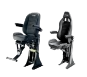
S3 Drop-Down Seat